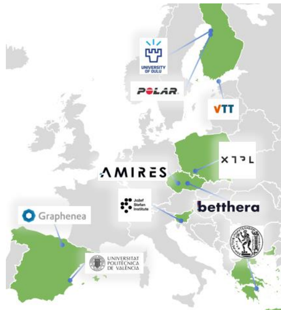
Figure 3 UltraSense Consortium map

This four-year project is funded by the European Commission under the Horizon Europe Framework Programme and is supported by the European Health and Digital Executive Agency. It involves ten public and private organisations across Europe. POLAR Electro OY will lead the commercialisation efforts, and the wearable device will be validated to achieve Technology Readiness Level 6 (TRL6).